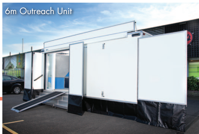
6m Outreach Unit