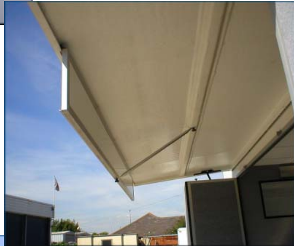
Canopy and headboard.