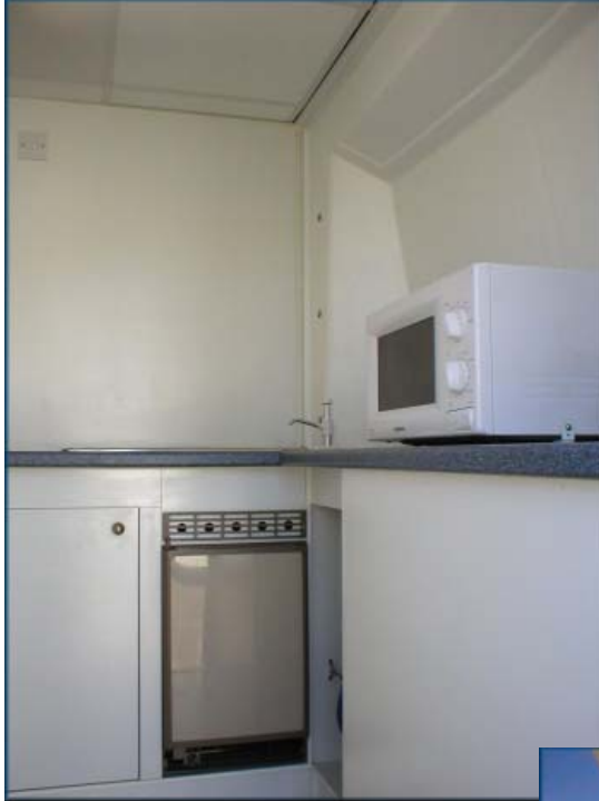
Crew Galley in nose cone area.