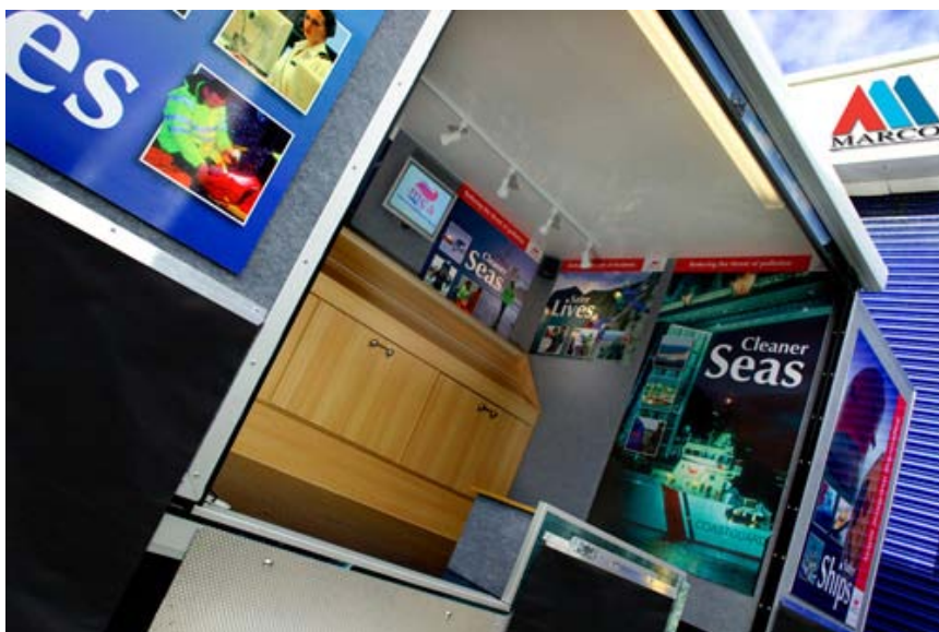
Image above is of an X25 unit but may not be the actual unit supplied